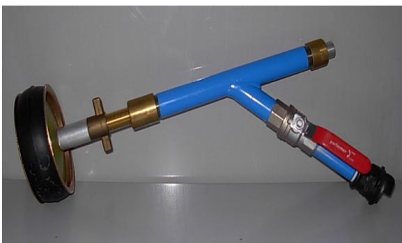
Seal Fitted to Compressor Blowing Gun