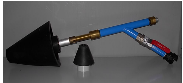
Cone fitted to Compressor Blowing Gun