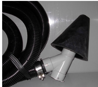
Cone Fitted to Hose