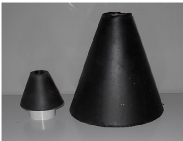
Conduit Blowing Cones

We can also provide an occupied conduit adaptor for conduits 80mm through to 100mm. These are used predominantly in the communications conduit sector but if your electrical conduit falls into that size range they can be utilised. These adaptors are fitted to your compressor air hose and come complete with a heavy duty toggle style on/off lever.