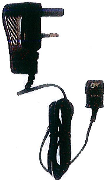
240V Ac Adaptor

Easily attaches in the field to protect the internal filter.