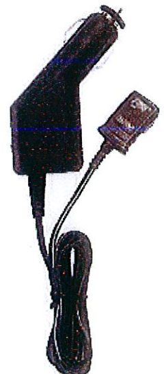
Vehicle Power Adaptor