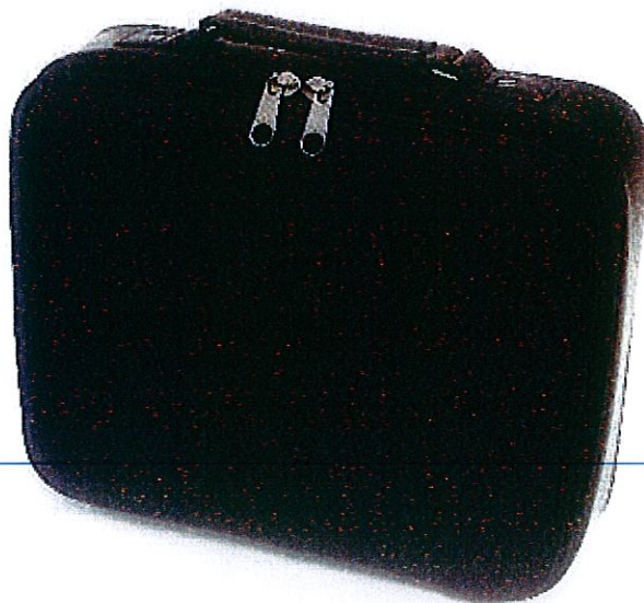
Leather Carrying Case