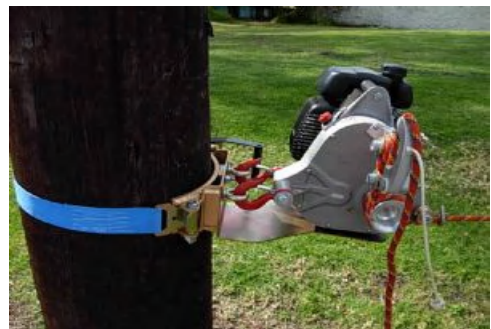
pole bracket adaptor to standard winch

One year warranty on entire unit. Two year warranty on Honda motor. Use in a well ventilated area, not to be used in confined spaces.