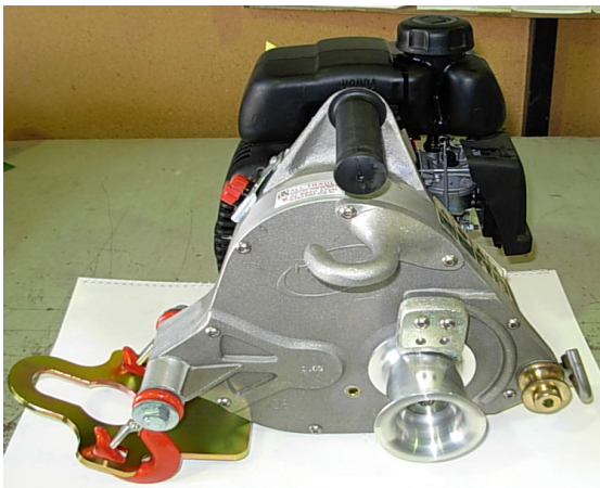
standard model showing towball attachment

After trialling various types of rope we have found that 11mm braided response rope performed the best, (pictured in photograph below.) This rope is normally supplied on a 200m coil as standard however custom lengths and splicing services are available on request.